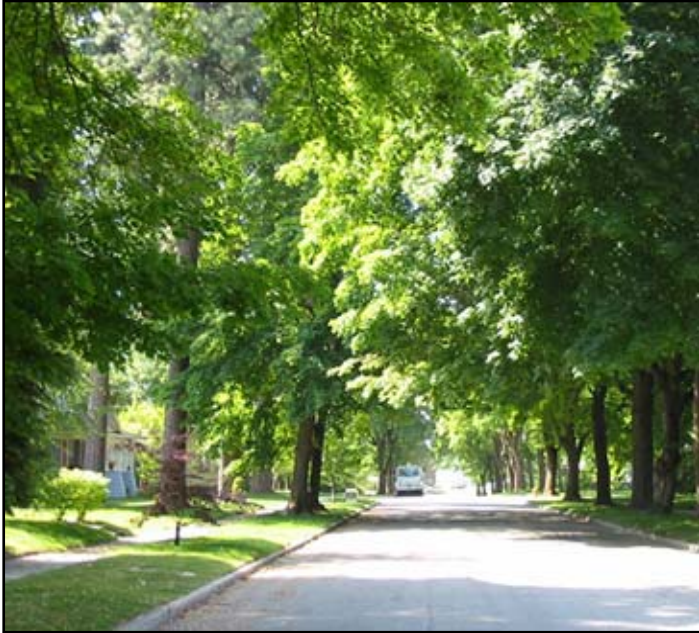
Graphic-1: A simple picture of a tree-lined street accentuates the Benefits of Trees by illustrating the cooling, pollution reduction, energy conservation and habitat creation (for people and wildlife) that urban tree cover provides.

Trees provide a myriad of benefits and enrich our quality of life in many ways. These benefits are even more valuable when provided in the urban environment.